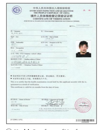
(8) Health Certificate of Verification

Fees for health check / verification: appr. CNY500 per person (paid to the hospital directly)