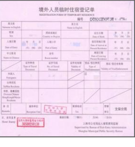
⑤ Registration Form of Temporary Residence (RFTR)