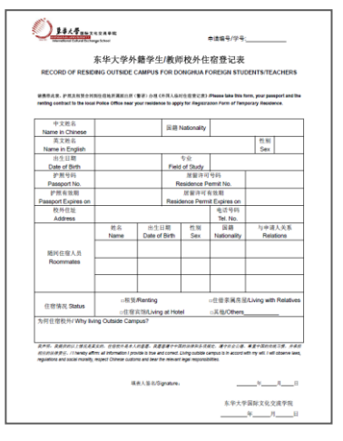
3) Record of Residing outside Campus for Donghua Foreign Students/Teachers