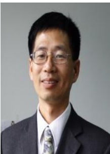
邱夷平 Yiping Qiu Professor Research Area:

Fiber products processing, processing of chemical fibre, biological technology, fiber modification; Textile fiber structure and performance study; Textile dyeing and finishing technology research;