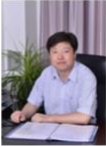
丁彬 Bin Ding Professor Research Area:

Functional nanofibers and their applications with regard to sensors, self-cleaning materials, battery separator, catalyst, filtration, protective clothing, oil/water separation, and biomaterials.